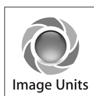
Image Units logo Grayscale